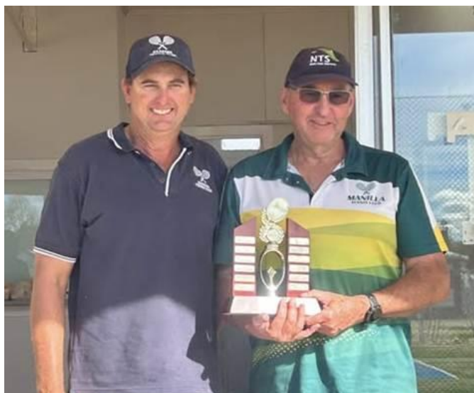
The Captains and the Cup

A big thank you goes to all the players from both Manilla and Barraba for their sportsmanship, commitment and effort throughout the day. It was great to see both clubs come together once again and make the return of the Split Rock Cup such a fun occasion. Congratulations to Manilla on taking home the trophy, and here's to the next chapter of this valued local rivalry!