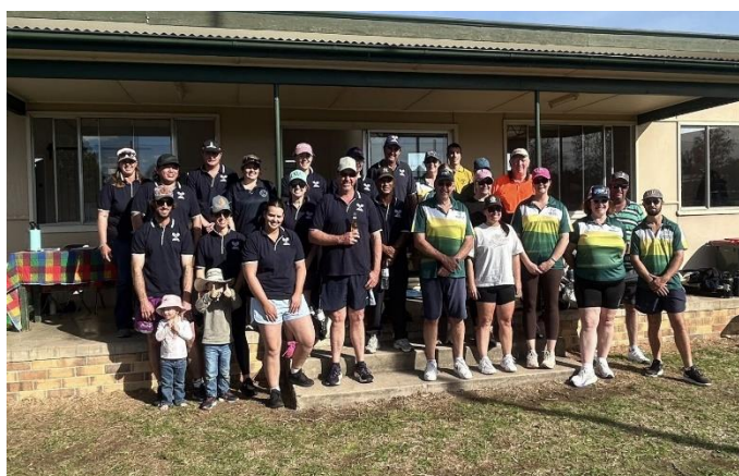
The teams: Barraba vs Manilla