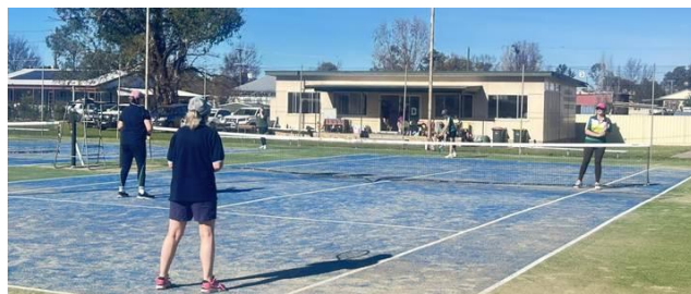
Play in progress