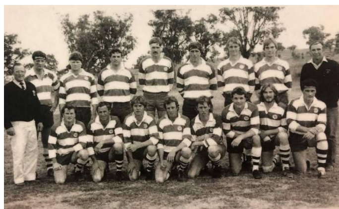
1986 Grand Final winning team

A huge thank you to everyone who attended, shared stories, supported the club and helped make the day such a special celebration of Barraba rugby history.