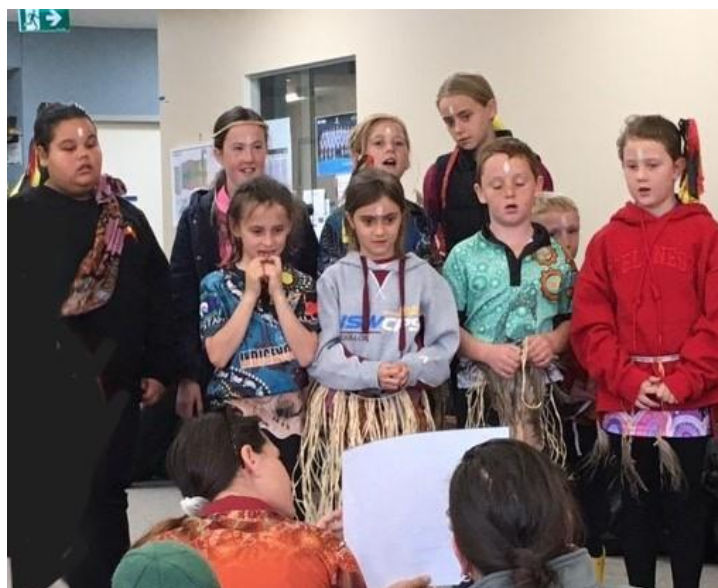
St Joseph's School students, sang in both Gomilaroi language and English.