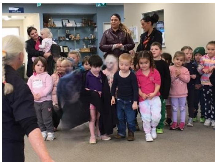
Barraba Preschool students Twinkle Twinkle in language