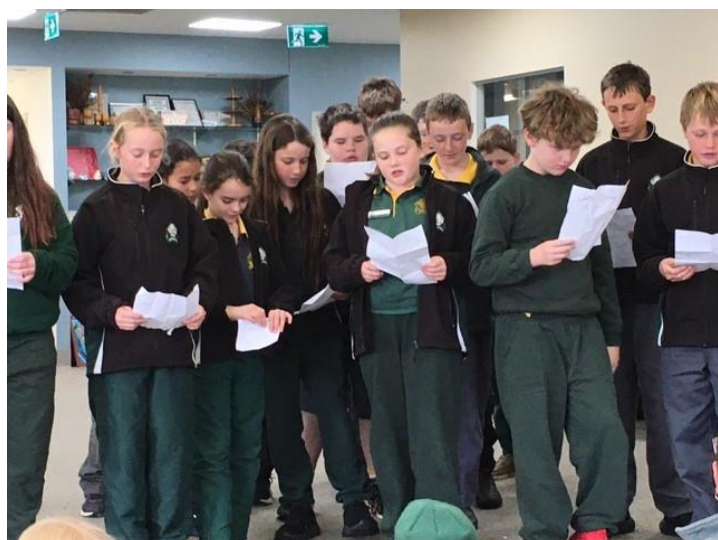
Barraba Central School students