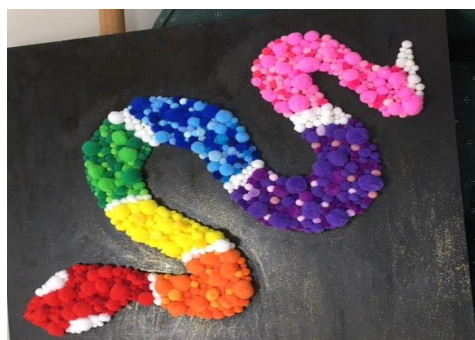
Rainbow Serpent art gift to the Health Service from the Central School students