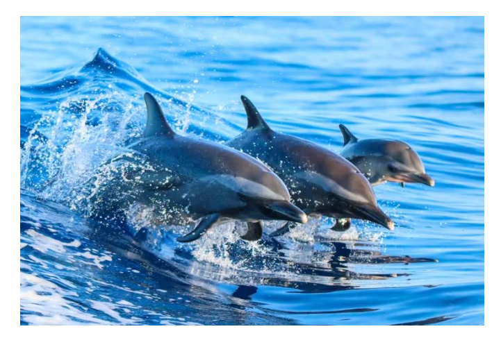
A dolphin can launch its whole body out of the water.

Have you ever seen images of dolphins jumping out of the waves and performing impressive acrobatics in the air? Or maybe you've seen it in real life? When a dolphin jumps, it can launch its whole body out of the water. While it looks like fun, it must also be hard work! So, why do dolphins jump out of the water? There are several possible reasons. Let's jump in and explore them.