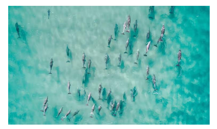
Dolphins have streamlined bodies but still feel drag underwater. F Photography R

Have you ever tried to walk underwater? You will have felt how hard it is. That's because water is more dense than air, which creates a "drag", or resistance. Dolphins have streamlined bodies to reduce drag, but they still feel it. So, if they want to travel quickly – for example, if they are trying to escape a predator or hunt fish – they sometimes jump. While in the air, they travel faster than they would through water, and also save energy.