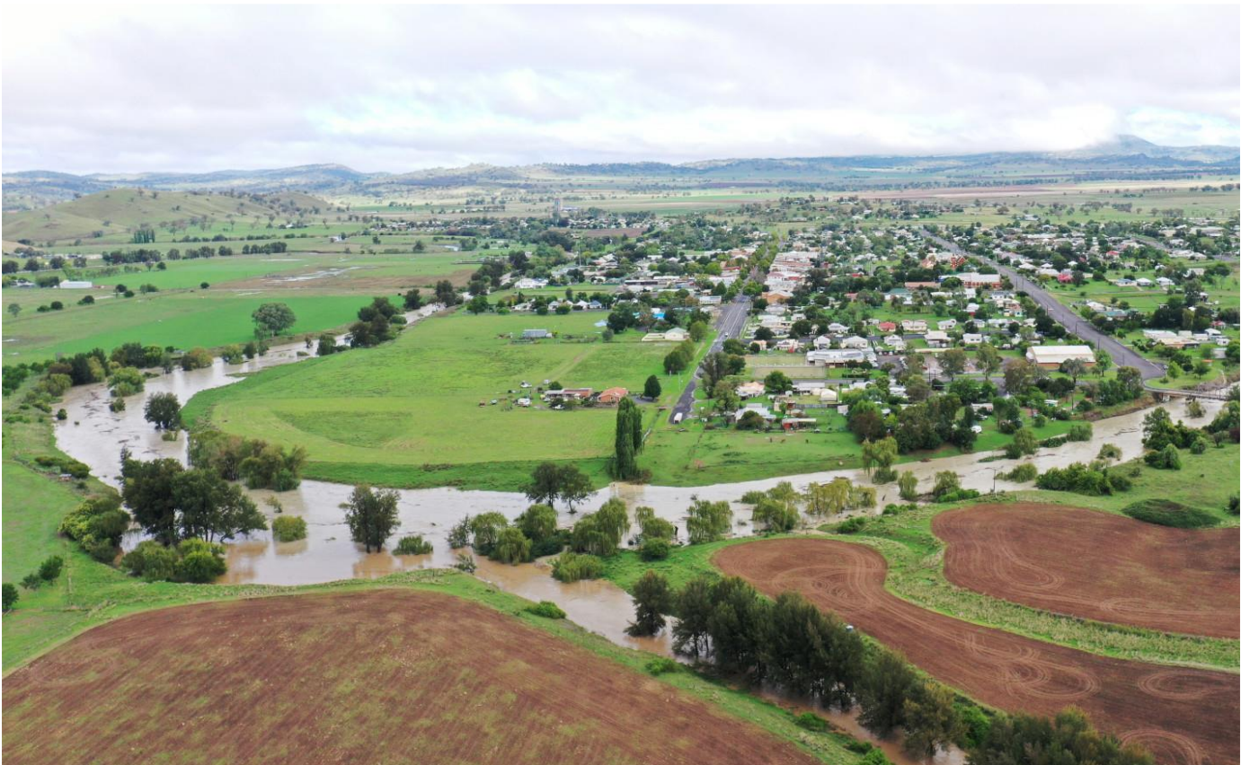
A great fresh in the river 29 th March 2025