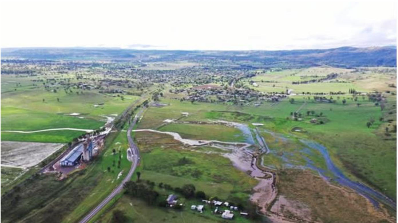
"Still draining away" 30 th March 2025