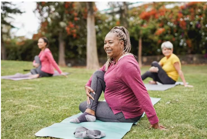
Women in Australia will soon be able to access menopause health assessments.

While the government cannot mandate what is taught in medical schools or the content of specialist training programs, its response to the inquiry encourages these institutions to incorporate menopause in their curricula.