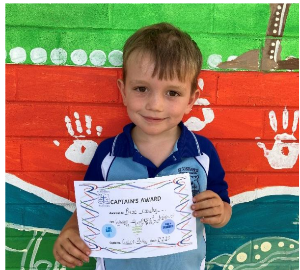
Captains award - Bede