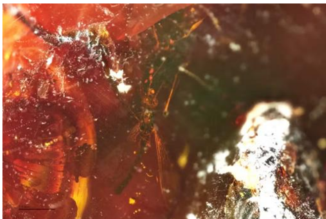
A 'non-biting' midge.

Some of the new major findings have been a "non-biting" or "feather" midge from the Podonominae insect subfamily.