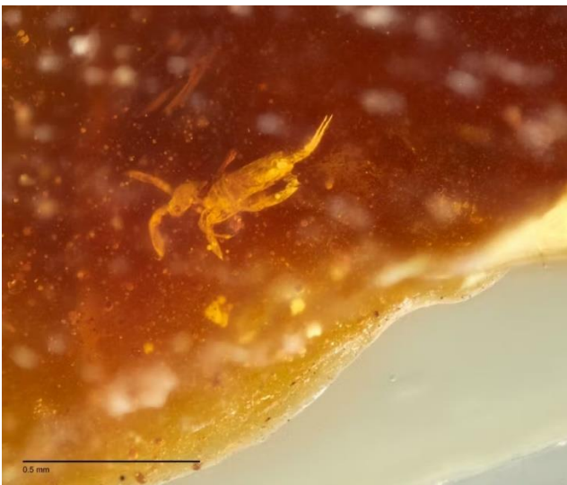
A fossil springtail – a common arthropod found in soil – trapped in Australian amber.

Australian amber is now helping to understand the biological diversity of ancient Gondwanan environments from 42 million years ago and their connections to today's Australian forests. From it, we can learn yet more reasons for why we must protect today's forests.