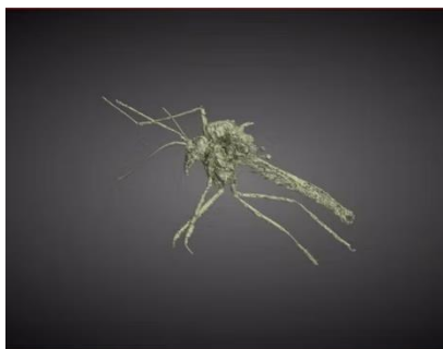
3D reconstruction of a fossilised 'non-biting' midge based on X-ray scans from the Australian Synchrotron.

The synchrotron has also made it possible to finally detect inclusions within large, opaque pieces of amber that were hard to examine previously with traditional microscopes.