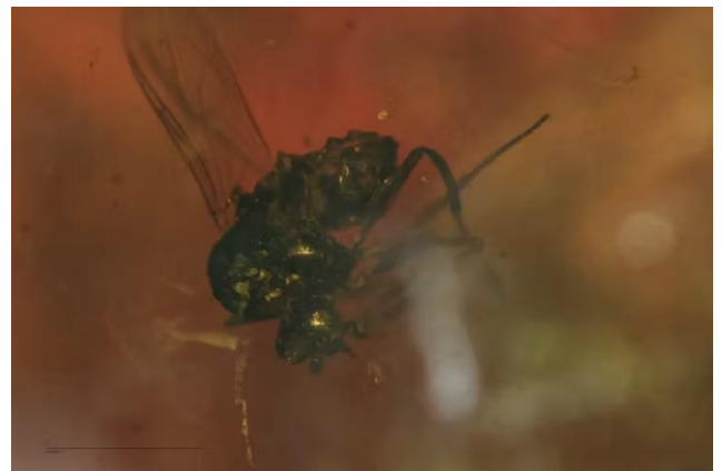
The full body of a midge captured in three-dimensional detail. Maria Blake

At that time, Australia and Antarctica were still connected as part of the slowly fragmenting supercontinent called Gondwana. Australia had a warm and moist climate, and forests teeming with insects, arachnids and other creatures.