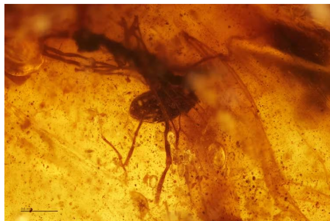
This parasitic wasp has a very scarce fossil record.

A wasp from the family Embolemidae, recognised today from all around the world to be a parasite on planthopper nymphs, is another highlight from Australian amber. This group has quite a scarce fossil record, and this is only the second time one has been found in the Southern Hemisphere.