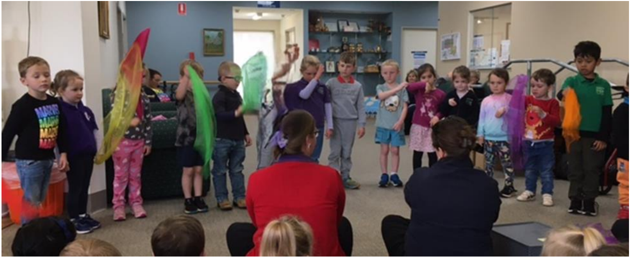
Barraba Preschool students. Some students sang a song in Gomilaroi language and others used sign language