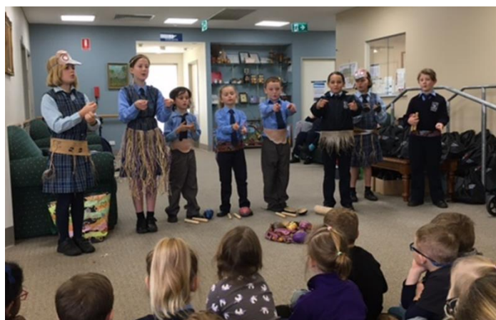
St Joseph's Primary School students with a dance and music