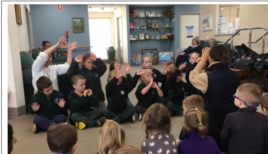
Barraba Central School, Primary Students, sung in Gomilaroi Language