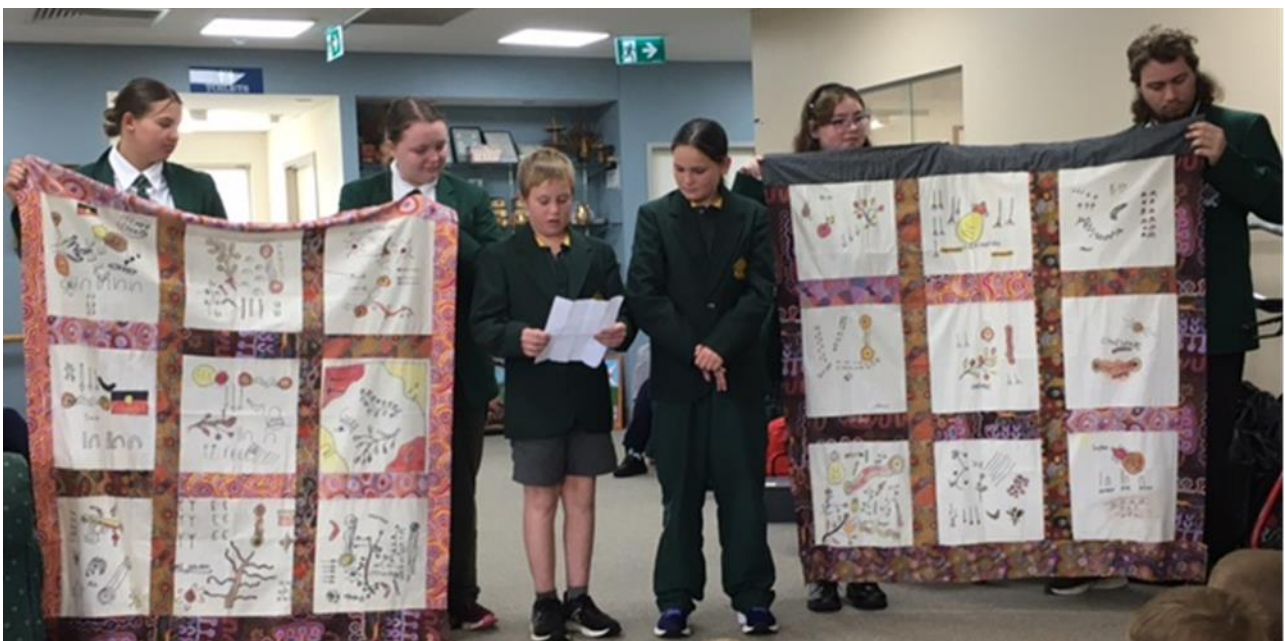
Barraba Central School, High School students spoke about their significant art work representing their Indigenous heritage