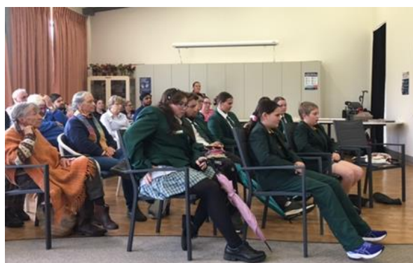
Part of the crowd at the Day Centre