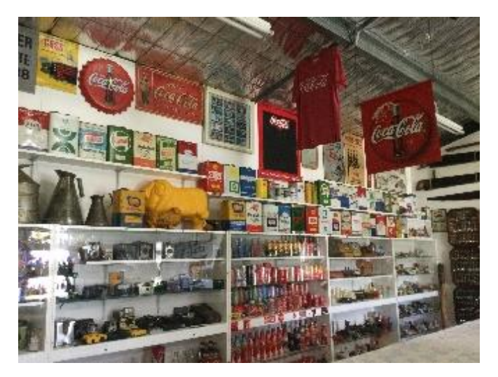
10am – 2pm Entry - Gold Coin Donation (Proceeds being donated to Cancer Research)

SATURDAY, 20th APRIL, 2024 110 Arthur Street, Manilla NSW