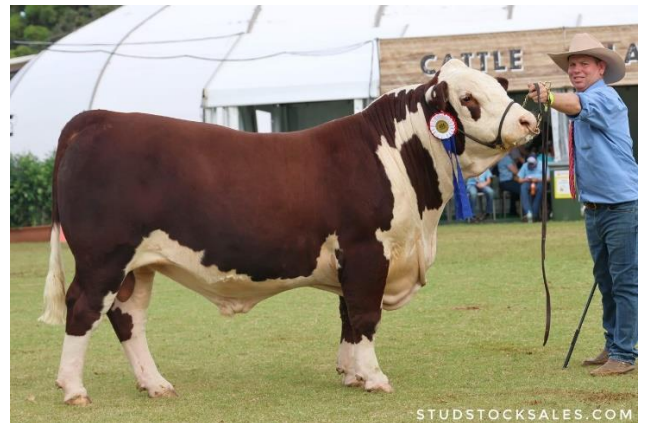
Ben Crowley leads Tycolah Viking T119 – Supreme Hereford Exhibit