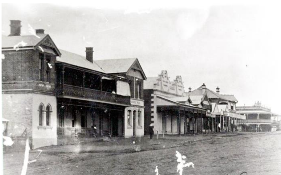
Photo 2: From about the same period from the Museum files this marvellous photo shows the Commercial Hotel, Dean & Smith, various businesses, the old Bank of NSW and the Royal Hotel on the corner.

Photo 1: Percy William's famous photo of the Cobb & Co. Stagecoach heading north in the early 1900s post 1903. Fully laden with bags, driver and 11 passengers.