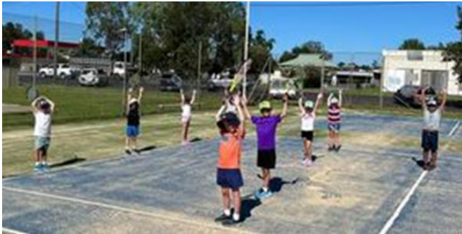
Christmas Tennis coaching camp on the new courts