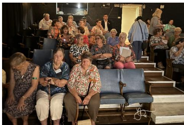
Attendees taking their seats in the Playhouse cinema.