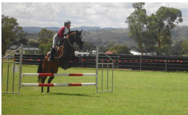
Clearing the bar – Showjumping 2021 Barraba Show

Definitely should not be missed; about 4.30 pm on Saturday 2 March!