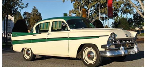
Chrysler Royal – early 1960s