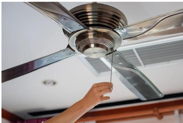
Using fans along with AC can help cool the room more.

If you have a time-of-use electricity tariff (it'll say on your electricity bill if you do), reducing use in the afternoon and early evening can save a lot. Energy prices can be double or more at these times.