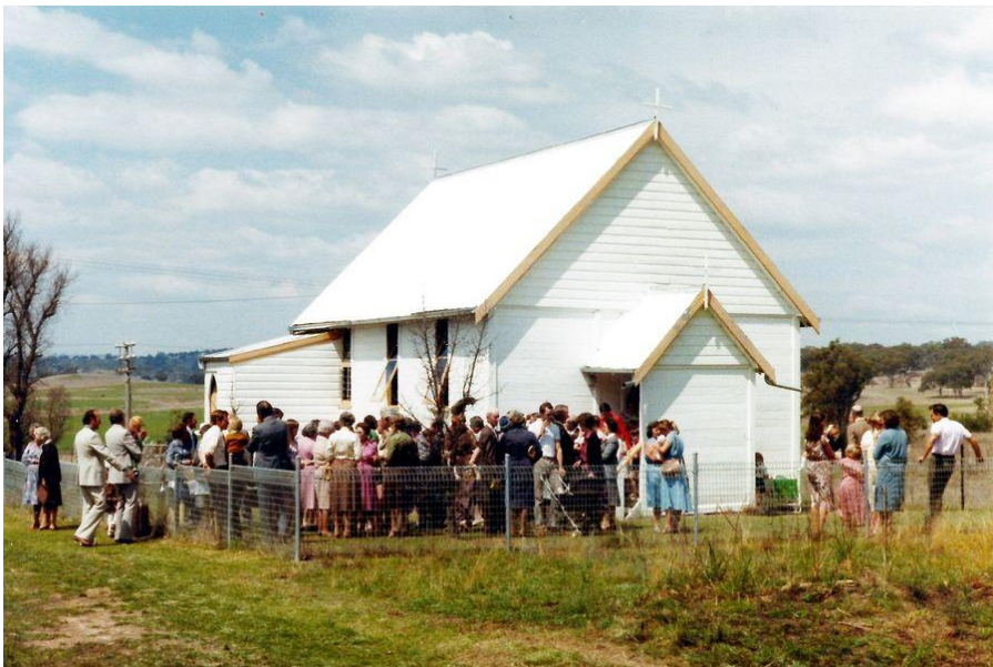
The 70th Anniversary Sept. 1979

The 50th Anniversary of the church in Feb 1960.