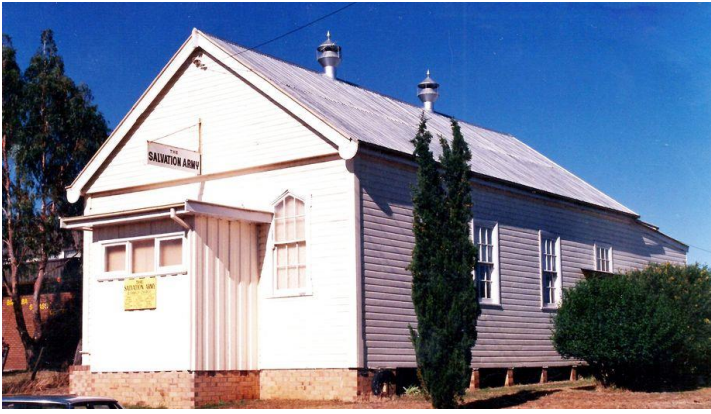
The Salvation Army Hall in Barraba in 1993.