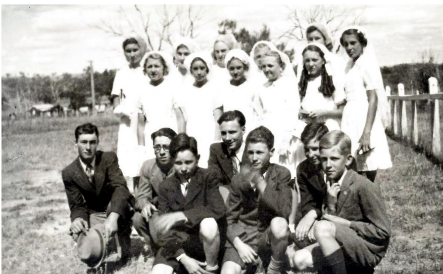
The earliest photo here was of the Confirmation Class on 7th. Dec 1943.