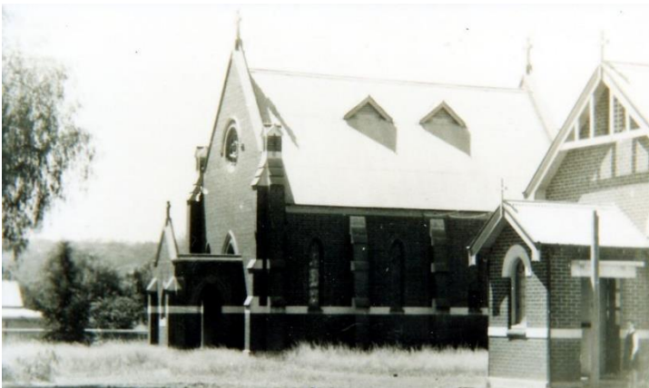
St. John's Catholic church in Fitzroy St.