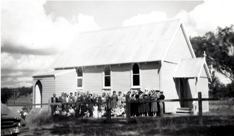
Church of the Annunciation at Cobbadah.