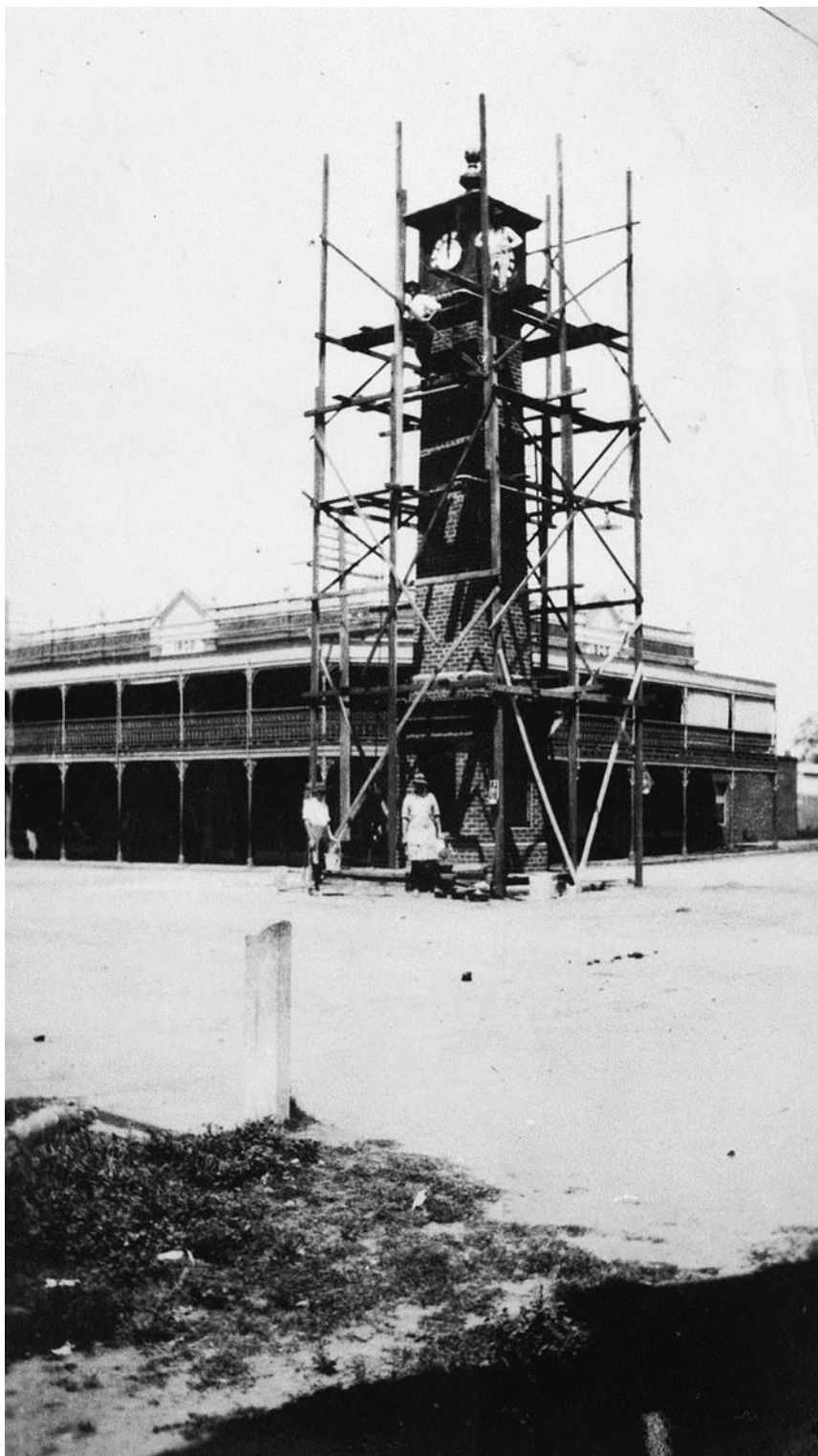
The construction of the War Memorial Town Clock in Barraba in 1924.