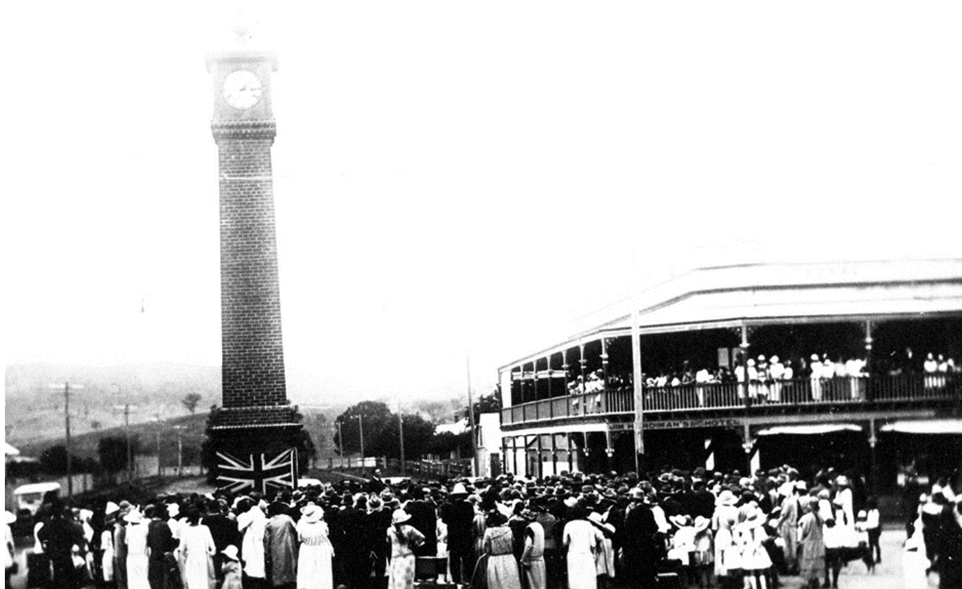
Armistice Day Celebration in Barraba circa 1925.

A good crowd in the street and on the balcony of the Royal and no doubt the Central Hotel.