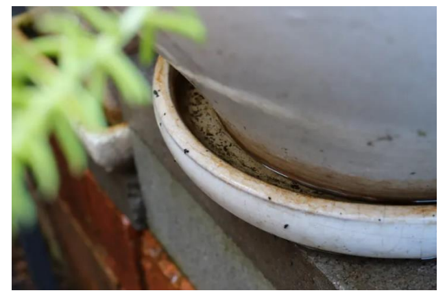
Water provides opportunities for mosquitoes to breed. A/Prof Cameron Webb (NSW Health Pathology)

Some plants contain essential oils and other chemicals that, when extracted and concentrated, provide protection against biting mosquitoes. But there isn't a lot of evidence that the whole plant will keep mosquitoes away from your garden. Some types of plants are even marketed as "mozzie blockers" or "mosquito repelling". But there isn't any evidence of effectiveness. In fact, some of these plants, such as melaleucas, also happen to be associated with hot spots of mosquito breeding in coastal Australia. The plants to avoid around the home are those that help mosquitoes breed, such as bromeliads, which trap water.