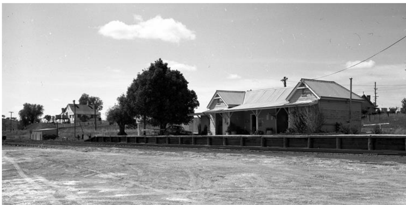
Barraba Railway Station in 1978.