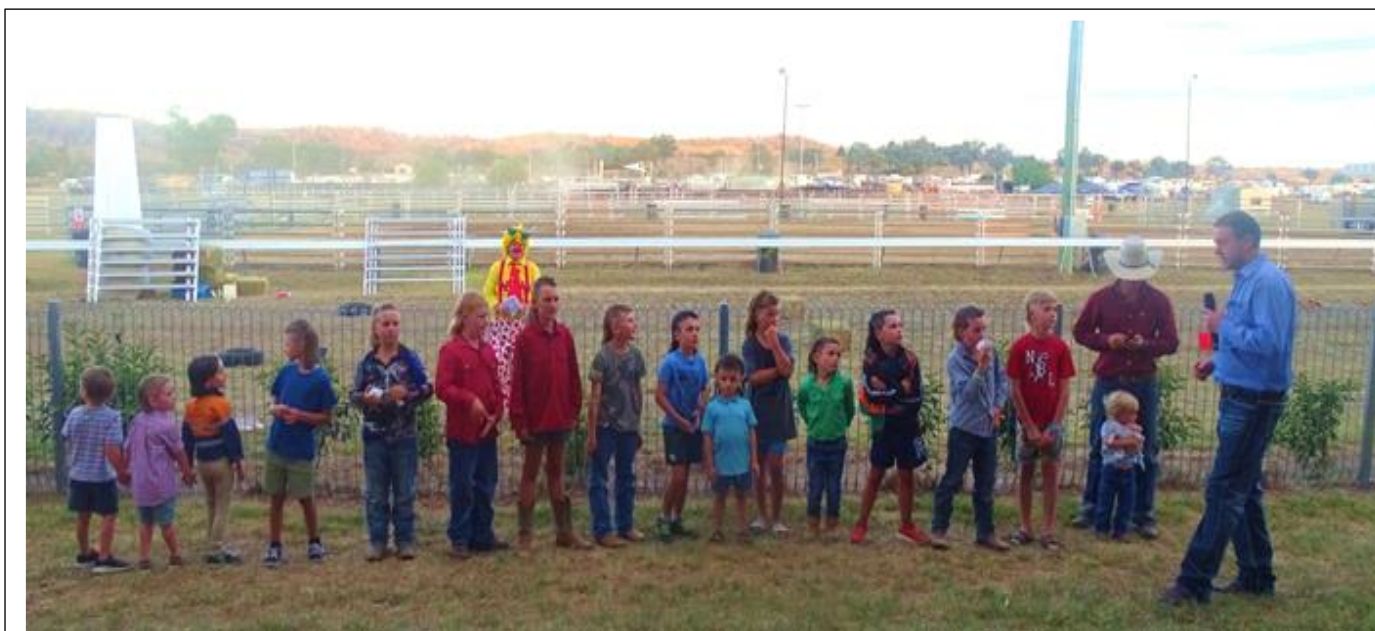
Competitors in the Junior Mullet line up