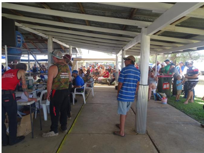
Part of the crowd watching the Sport Shear Competition at the Barraba Show