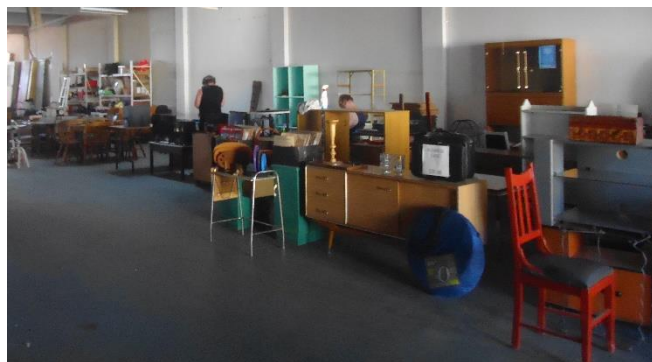
Hard at work in the new Shed Shop