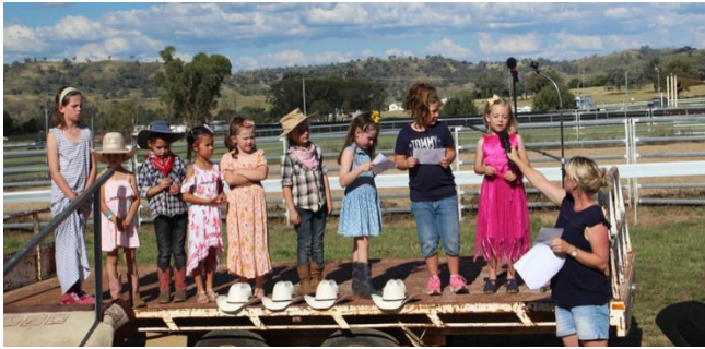
Pictured: 2021 Junior entrants

This year there is a mini competition open to all Girls/ Boys 5 and under; you enter as a mini young woman/man. All girls/boys up to between 6 – 9yrs, 10 – 14yrs and 15 – 17 years are invited to participate in the Junior YOUNG WOMAN/MAN competition in 2023.