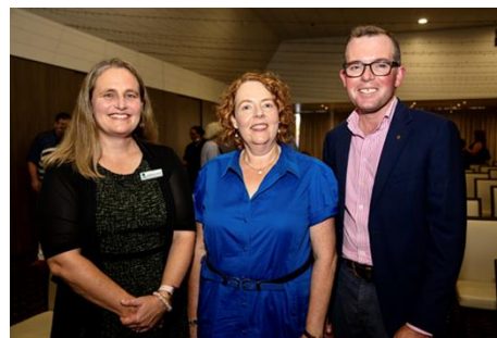
Photo caption: A huge win for the future to the GP workforce with news today that the region

Mr Marshall said the next steps would see NSW Health engage with the Commonwealth's Primary Health Network to sign up GP practices across the Northern Tablelands to take junior doctors, then recruit for multiple positions across the region.