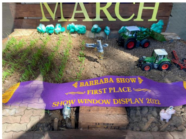
Last year's winning display.

The 2023 Barraba Show is fast approaching, only 2 weeks to go! The show society is once again asking all businesses to promote the show with a window display. Do you think you have this year's winning window display? The pavilion theme is "Fish" but displays are not limited to this. Displays are getting better & better every year and becoming very competitive. We all wait & look forward to see what ideas everyone comes up with this year. Once again thank you everyone for your support & promotion of our show.