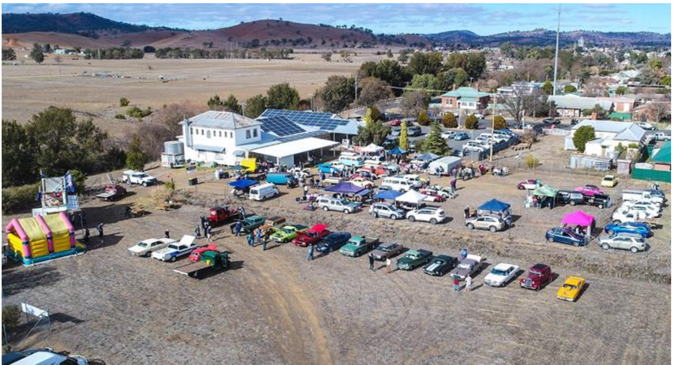
Picture from the last very successful North West Auto Fest