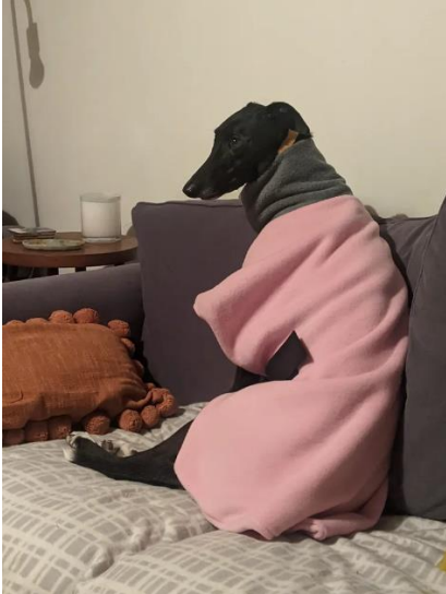
Greyhounds, which have short fur and little body fat, really feel the cold. Here is Walnut wearing her warm pyjamas. Anthea Batsakis

If you've got a dog in the yard, make sure they have access to shelter and a bed to get them off the cold ground, especially when there is a cold wind.