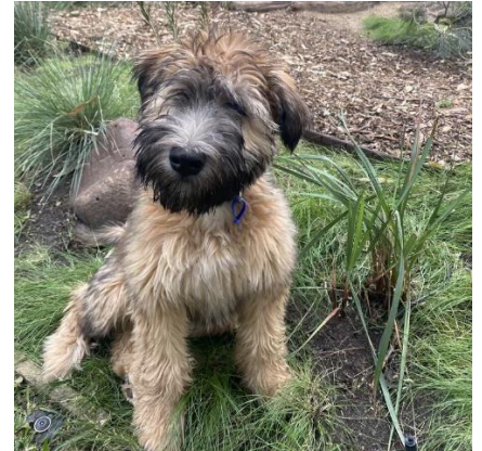
Wheaten terrier puppy Cookie has thick fur. Lucy Beaumont

If we feel cold then they probably do too. A thicker coat helps slow down heat loss, which is good if you live in a cold environment, but not so great if you live in a warm environment.