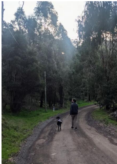
Walnut, a two-year-old greyhound, wearing a warm, waterproof coat on a walk near Kinglake, Victoria. Anthea Batsakis

Sometimes you just want to cuddle up to a warm friend, though. It's hard to argue with that!