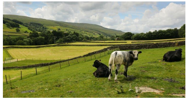
Though picturesque, life on the Yorkshire Dales was tough.

Jim's work is physically demanding. Being woken by a phone call in the middle of the night to drive to a cold farm and tend to a sick animal is commonplace. Still his willingness to do it earns him respect and hospitality on the bleak farms, where farmers might invite Jim in “for a bit o' dinner” or “slip half a dozen eggs into the car”. There are moments of joyful professional satisfaction, too, such as when Jim safely delivers a newborn lamb and its twin, which has been caught in the ewe's birth canal. Herriot laughs at himself as often as he does at the people around him.