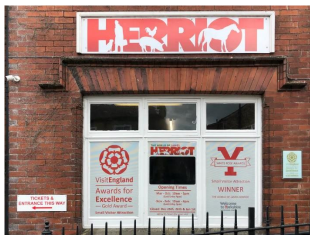
The Herriot Museum in Yorkshire.

When the two books were combined into All Creatures Great and Small for US publication, also in 1972, the omnibus volume had huge success. From there, a franchise was born.