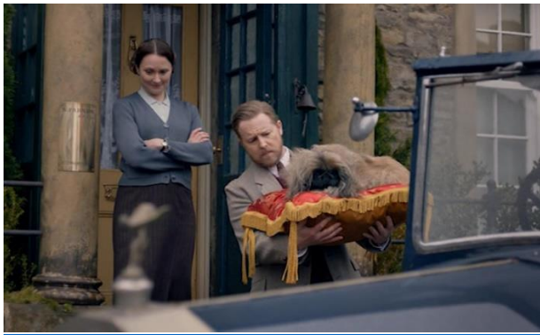
Anna Madeley (Mrs Hall) and Samuel West (Siegfried Farnon) in the most recent TV adaptation of All Creatures Great and Small (2020).

Farnon, with whom Jim shares the vet practice, the wealthy widow Mrs Pumphrey, and a series of dour Yorkshire farmers including Jim's future father-in-law Mr Alderson.