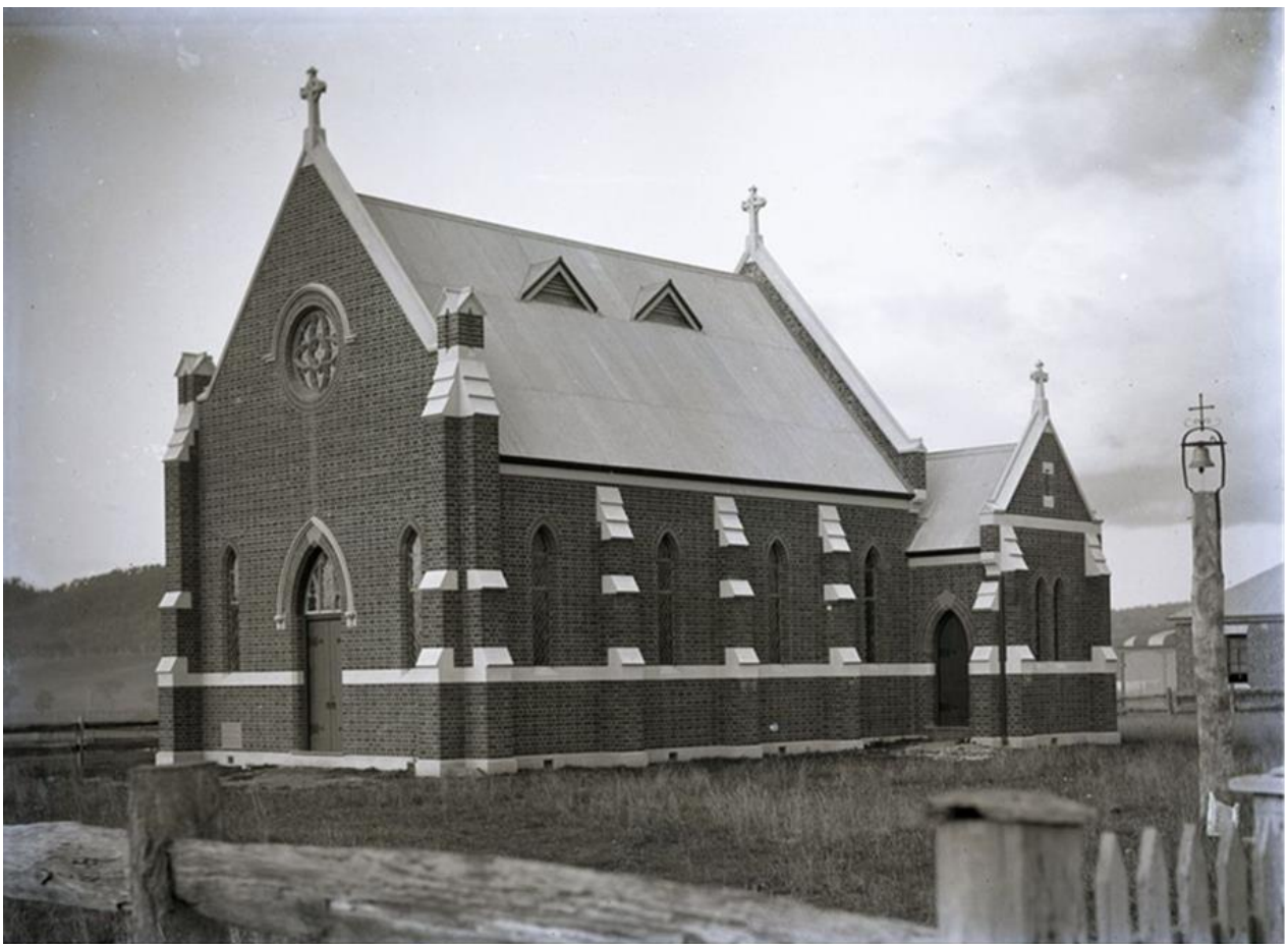
The original Catholic Church. This was extended to it's current for form during the 1940s