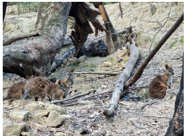
Parma wallabies weigh just 5kg, making them vulnerable to dogs, foxes and cats

We do know its preferred habitat is moist eucalyptus forest with thick, shrubby understory. It shelters there during the day, often with nearby grassy areas as, at night, they typically feed on grass and herbs. They're also found in rainforest margins and drier eucalypt forest, but to a lesser extent.