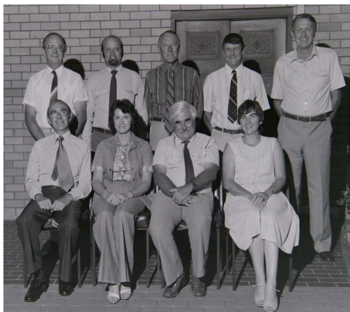
Barraba Shire Councillors in 1980.