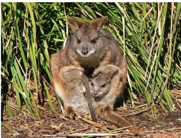
Parma wallaby was presumed extinct for 30 years.

The species was introduced there a century earlier by former Prime Minister of New Zealand, Sir George Grey, who's zoological interests led to Kawau becoming home to a menagerie of exotic animals.