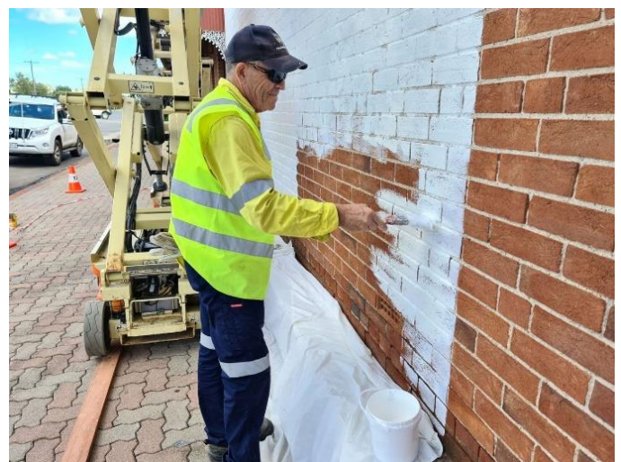
A rural aid volunteer paints the Alice St Wall in March 2021