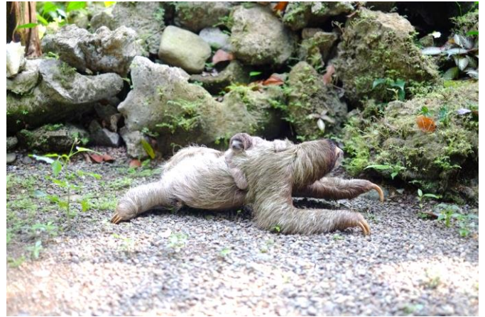
Sloths move much more slowly on the ground than in the trees.

This type of diet is extremely rare — only about 100 other types of animals that live in trees are folivores, and Australia's cuddly koala is one of them.