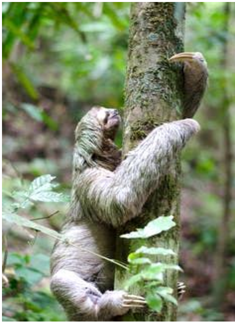
Sloths are under threat when their trees get chopped down.

Unfortunately, when trees in forests are chopped down, sloths and koalas must travel further away along the ground to find food and mates. This exposes these rare animals to dangers, like cats and jaguars, or busy roads where they could get hurt.