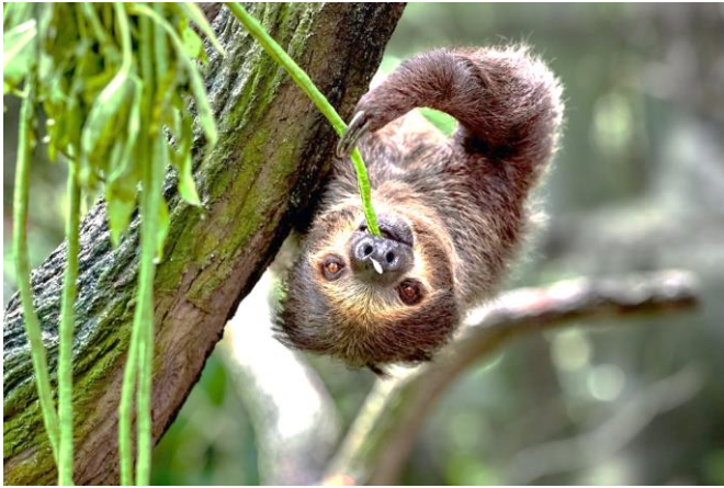
Three-toed sloths eat only leaves and flower buds'.

Compared to sloths, koalas are much more active but often only with a short burst in energy. Koalas move about 190 metres every day, but some have been recorded moving as much as 2,500 meters in one day .