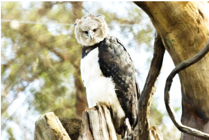
This is a harpy eagle, one of the animals that eat sloths.

The reason sloths go slow has a lot to do with what they eat. Let's look at why.