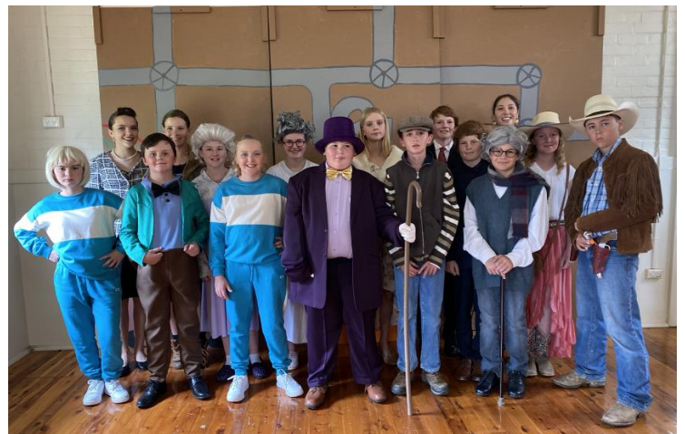
The cast and director of Charlie and the Chocolate Factory