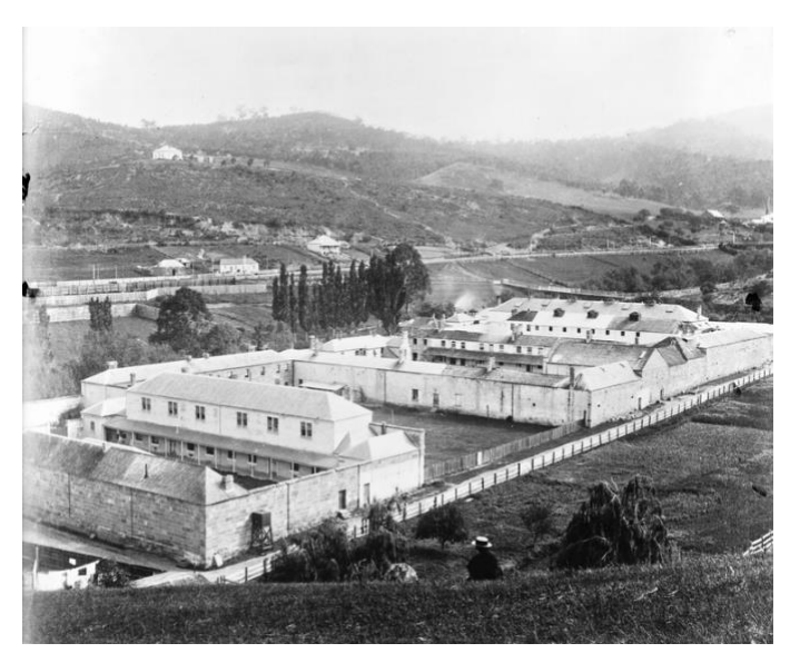
The Female Factory in Hobart.

There were significant passages of their lives that could not be spoken of, stories that could not be recounted, memories that could not be shared. Always they had to calculate how best to obscure the missing seven or ten years of their servitude in their personal narrative.