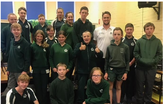
Pictured above Barraba Central School Secondary students with Olympic swimmer David McKeon