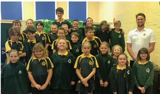
Pictured above Barraba Central School Primary students with Olympic swimmer David McKeon