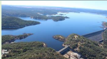
Regional Dam Levels from Water NSW

Chaffey 93.8% Copeton 61.2% Keepit 92.3% Split Rock 35.9%