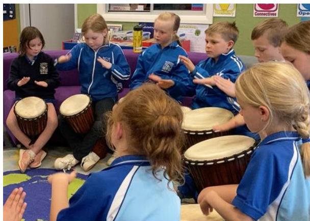
Children concentrating hard on playing the Djembe